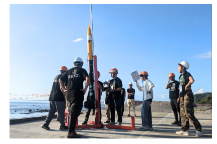
NYCU's Institute of Space Systems Engineering students prepare the SSTO solid rocket for its successful launch at Pingtung Syuhai Base on August 5th.

The successful launch of the SSTO rocket marks a significant milestone for NYCU and its students, showcasing their dedication and ingenuity in the field of aerospace engineering. This achievement highlights the potential of student-led projects and inspires a new generation of engineers to reach for the stars. As NYCU continues to foster innovation and practical learning, the future of space exploration in Taiwan looks brighter than ever.